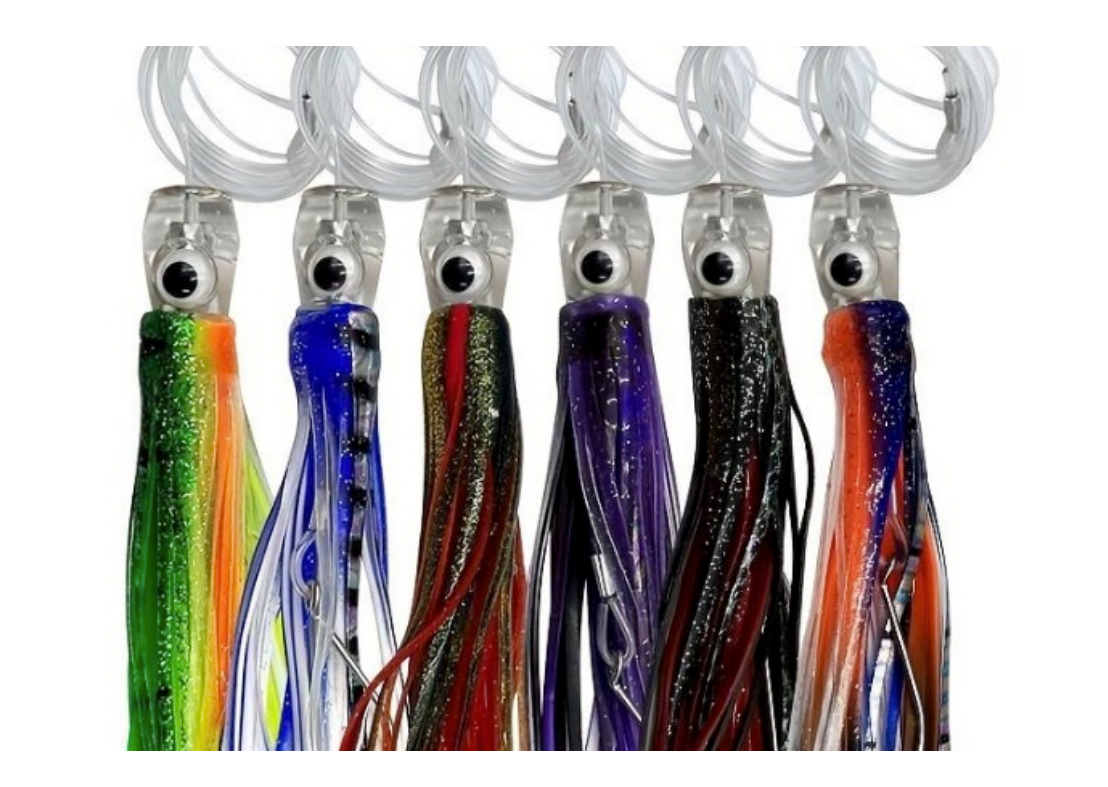
Squid in various colors

We use 50 lb. test monofilament, as much as the reel will hold. This is attached to a swivel and a 36" wire leader. Knots work okay to attach the leader, but I feel better about using crimp connectors. Then I have an assortment of lures that attach to the leader. My favorite is a simple cedar plug – we have caught more tuna and dorado using it than any other. I also like Rapala Countdown Magnums in various colors, as well as several octopus skirts in various colors. The cedar plugs and octopi work best if the boat speed is above 5 knots. The Rapala works best below 5 knots. Tuna seem to like grey and silver lures, dorado seem to prefer the bright colors (except they all seem to like the reddish cedar plug).