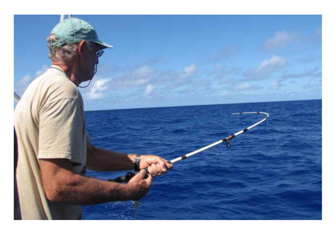
Tuna on the line

Our fishing equipment has really evolved thanks to a lot of reading and help from friends who knew a lot more about fishing than we did. Our first thought was that we would trail a really heavy line – maybe 200 lb. test – and use the winch to crank in anything we caught. We weren't into fishing as a sport, but rather as a means to gather food. That approach had two big flaws. The most significant problem was that we very rarely caught anything. I think it was probably due to the line being so large and visible, and having no give. Unless we were very lucky, a fish hitting it would have the line snatched right back out of its mouth. We tried adding a shock cord, but it didn't seem to help a lot. The other problem was that on the rare occasion we caught anything, cranking it in using the winch ended up with a big pile of tangled line that took hours to sort out.