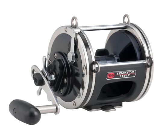
Penn 115 Senator

enjoy each immensely, but a ten-page booklet addressed to the specific info I needed on either subject would have been better primers.