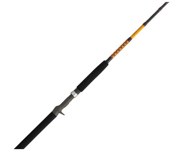
Ugly Stick Big Water Conventional

So what do we use? Our offshore equipment is rather modest, as we aren't interested in landing huge pelagic fish. If the fish is more than about 25 pounds, we can't eat or freeze it all, so we will reluctantly let it go. This often means losing the lure as well. The reel that has served our needs is a Penn 115 Senator. You can probably get it at WalMart or on the internet for less, but the West Marine price in my old catalog is $179. Our rod is a simple Shakespeare Ugly Stick, medium weight for $60. To hold it in place, I use a homemade PVC rod holder that I lash to the stern rail. Having lost one rod overboard, I now secure it to the boat using some 1/4" line and a carabiner.