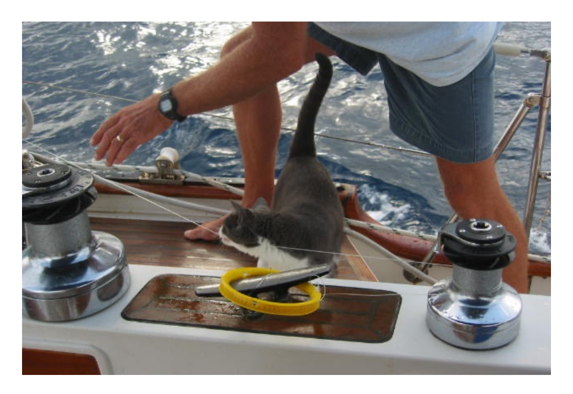
Jelly was always ready to help

As to trolling with the dinghy, we don't do much of that. When we were in the Carib, we occasionally used a hand line over the side in an anchorage, and caught a number of grouper and snapper (after asking the locals whether ciguatera was a problem). In the Pacific, we don't expect